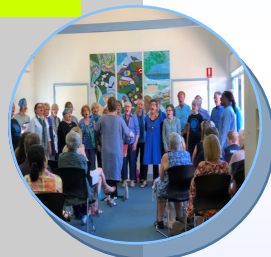
One World Choir