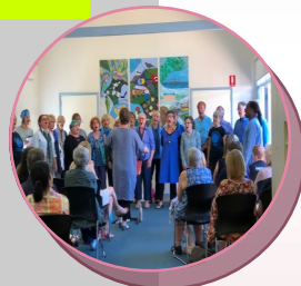
One World Choir